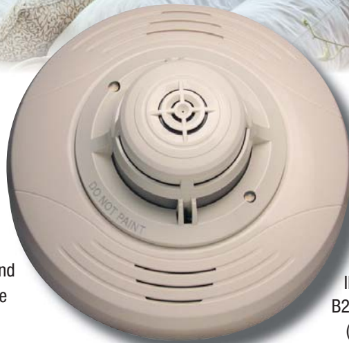
IDP-FIRE-CO with B200S Sounder Base (Sold Separately)

The IDP-FIRE-CO multi-functional device eliminates the need for a separate CO detector, smoke detector, mini horn, monitor modules, and all of the associated wiring and junction boxes. It also eliminates additional addresses consuming points on the loop. The detector installed inside the sounder base is the only visible device improving the appearance of any room.