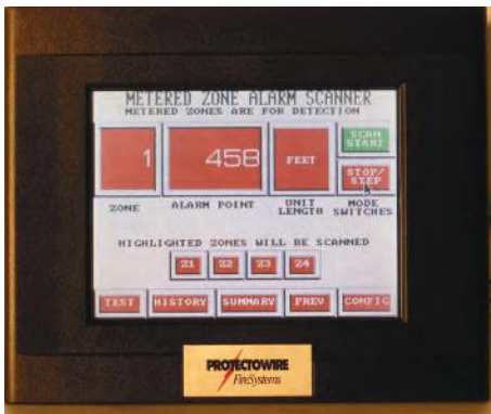
PCLC Graphic Display (2600HD3)